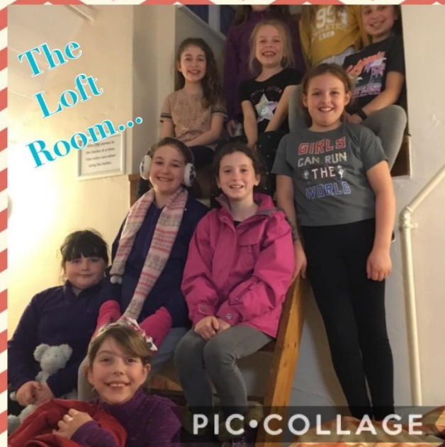
The Loft Room...