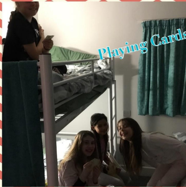
Playing Cards Before Bed...